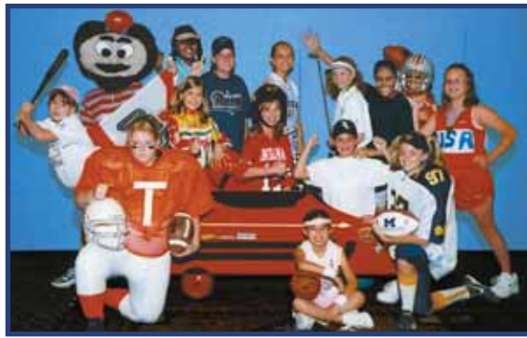
FUN! FRIENDSHIP! EXCITEMENT!