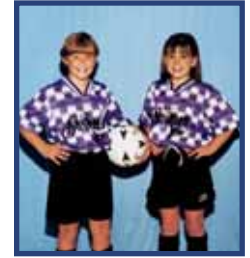
DEVELOPMENT OF PERSONAL SKILLS AND ABILITIES