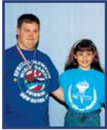
VOLUNTEER SERVICE TO COMMUNITY