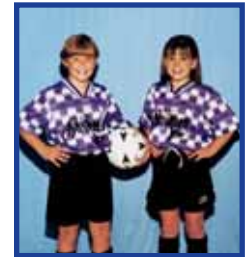
DEVELOPMENT OF PERSONAL SKILLS AND ABILITIES