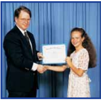
SCHOOL HONORS & ACTIVITIES