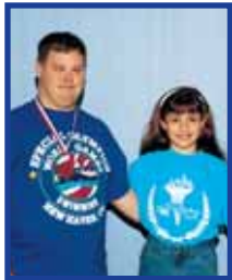
VOLUNTEER SERVICE TO COMMUNITY