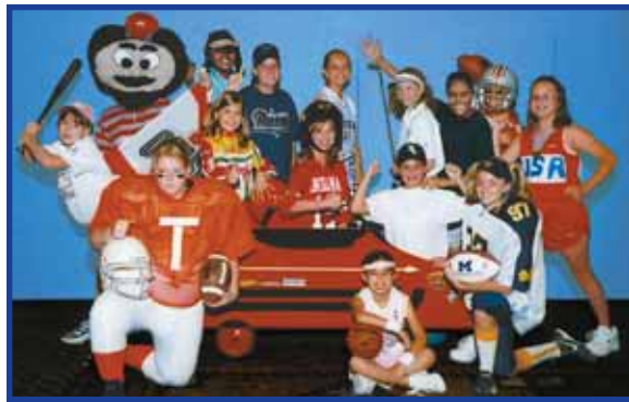
FUN! FRIENDSHIP! EXCITEMENT!